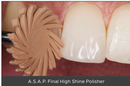
A.S.A.P. Final High Shine Polisher