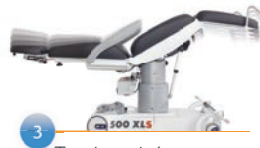
Treatment / surgery 1