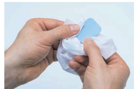
Image Plate Cleaning Wipe

Perfectly tailored for a digital workflow with an image plate or sensor. Can also be used in the traditional manner.