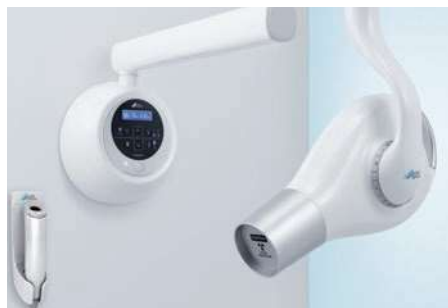
Image plate holders from Dürr Dental offer optimum protection for the image plate with their smoothed and rounded edges. Holders are available for all applications – their use helps to ensure that accurate X-ray images are produced.