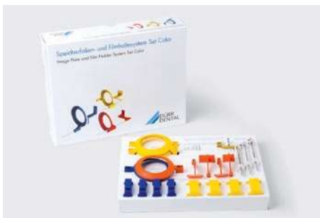
Image plate holder system

www.duerrdental.com/ gewaehrleistungsverlaengerung