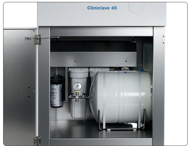
MELAdem®56 with storage container, fitted in a floor unit of the Cliniclave®45