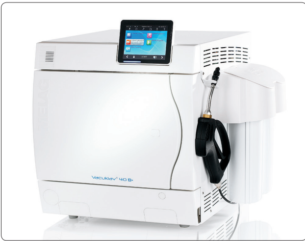
Vacuklav® 40 B+ with MELAdem® 40 and MELAJet® spray pistol