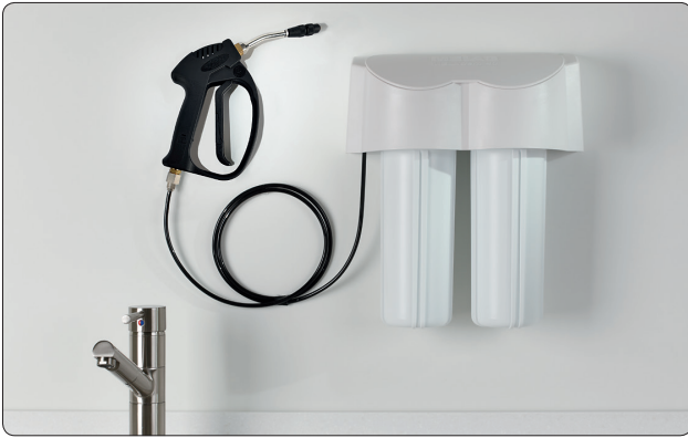
MELAJet® installed on the MELAdem® 40