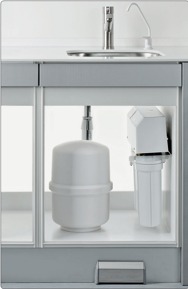
MELAdem®47 with removal valve and storage container, fitted in a floor unit