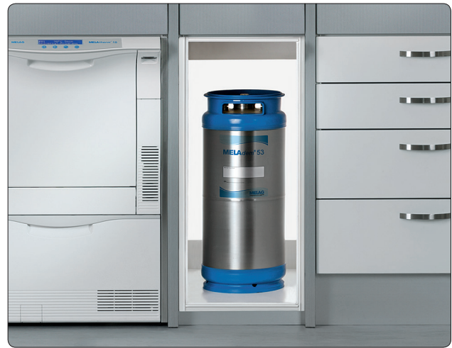
MELAdem® 53 fitted in a floor unit