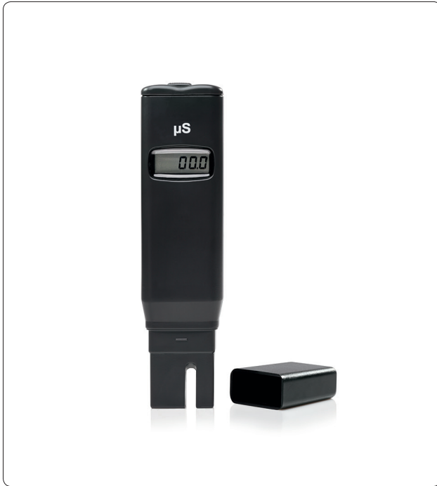
MELAtest® 60 inc. protective cap