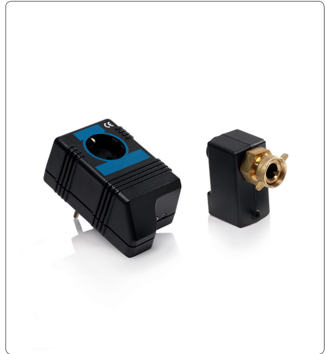
The water stop consisting of a control device (left) and a solenoid valve (right)