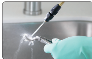
Fig. left: MELAJet® with individual attachments