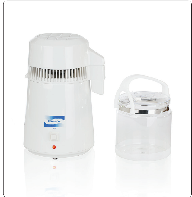
MELAdest® 65 with glass flask