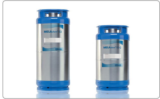
MELAdem® 53 and MELAdem® 53 C